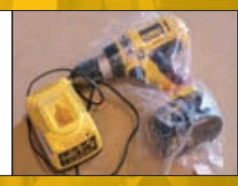
User has dropped battery causing Old charger brought back with brand new drill

Batteries accepted under Warranty must be submitted to the Agent complete (tool, charger & original batteries) to qualify.