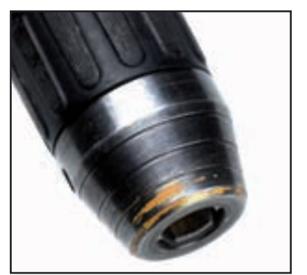
Wear caused by operating the drill with the chuck running against masonry or other hard surfaces

To ensure long service, motors are equipped with a cooling fan. The efficiency of this cooling system is directly related to the speed of the armature. When increased stress is placed on a motor, more energy is required to sustain the rated RPM. Under prolonged stress the motor speed drops and the cooling effect decreases rapidly. The motor temperature then increases which may result in critical overheating.